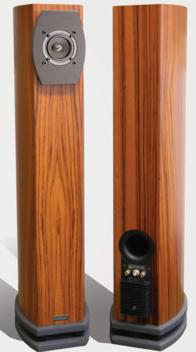
Comp 7 Drive